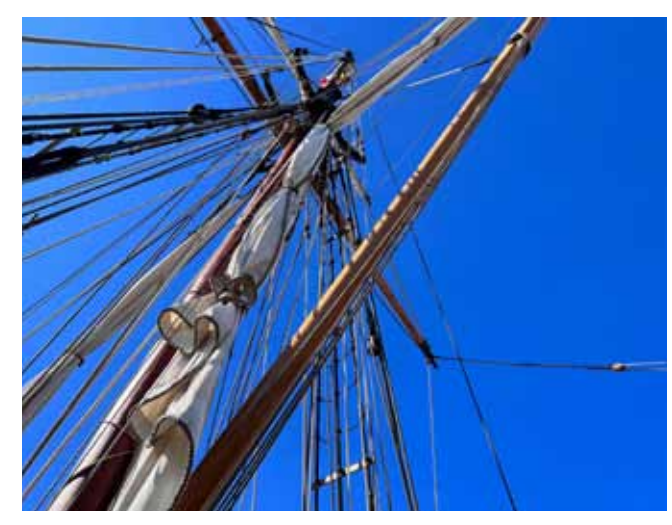
The riggings provide subject matter for many photos. Shown here is the Kalmar Nyckel and the Dove.